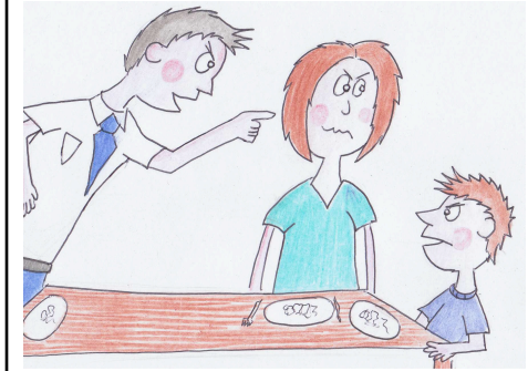
4. Mum and dad argued with me.