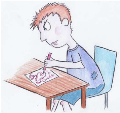
1. At school.